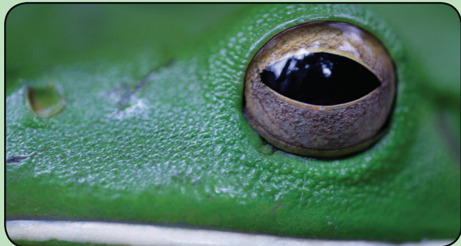
Wonderful Photographic Opportunities