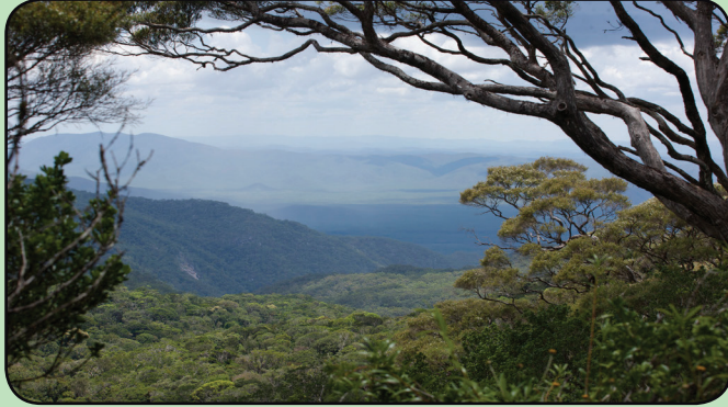
Unique Private Remote Locations

The World Heritage rainforest and adjacent wilderness areas are showcased with small highly experienced interpretive tours. Operating over 20 years in the Daintree and Cape York. We offer tours and Locations that are exclusive to Odyssey Bound.